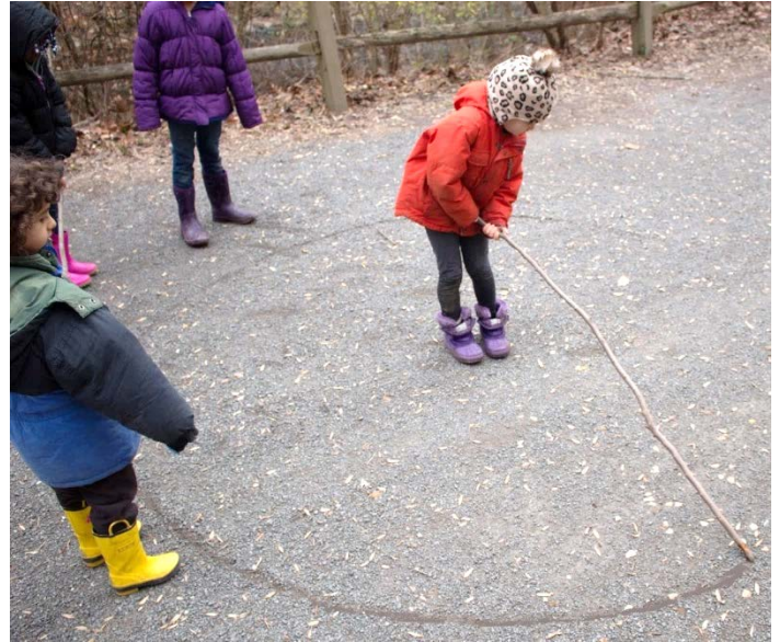
The child becomes, literally, the center of the lesson during Forest School!

This first trip to the Wissahickon was also the first Forest School experience with genuine discomfort for some of the children. Getting through this discomfort took patience and trust in the adults as they modeled how to respond to being damp and cold while out in the woods, but by the end of the day, the children's willingness and fortitude led to smiles and insight as they reflected on their experiences. May there be many more such opportunities in the new year! 🏠